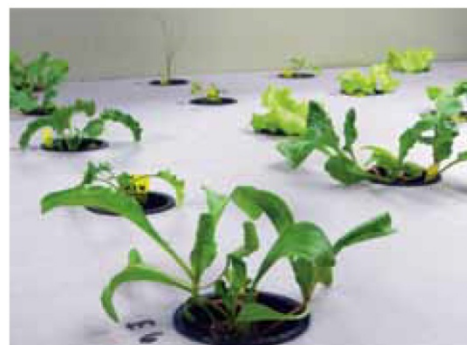
Some of the plants selected for growing and extracting nutrients at temperatures experienced in salmon hatcheries.

most appropriate systems, based on water quality, nutrient loading, flow and discharge characteristics, nutrient concentrations and bioavailability, temperature, light, space availability, plant candidate specific growth and absorption requirements and economic viability and markets. The analyses indicate that recirculating hatcheries are more valuable candidates for FIMTA systems than conventional flow-through hatcheries.