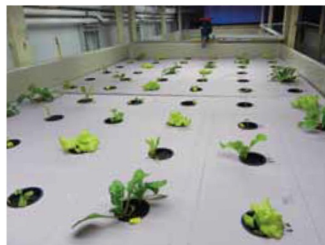
The FIMTA pilot-scale system operated at the University of New Brunswick in Saint John. Tanks with extractive species in the foreground; reservoirs of salmon hatchery effluent water in the background.

Over the last year and a half, a comprehensive field and laboratory feasibility study was conducted to investigate the potential for developing FIMTA systems for the Atlantic salmon hatcheries operated in New Brunswick by Cooke Aquaculture Inc. Both flow-through and recirculating facilities were assessed to design the